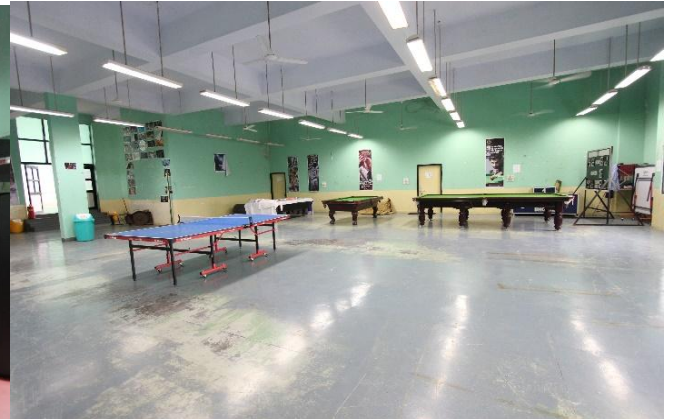
Gymnasium and Sports Facilities